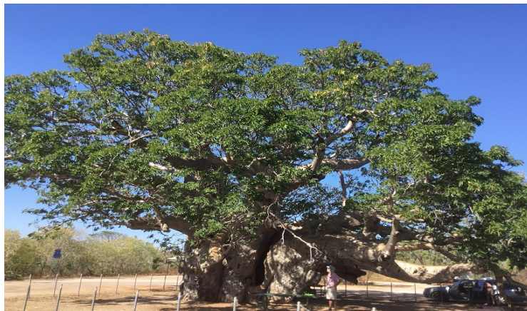
Giant Boab Derby WA