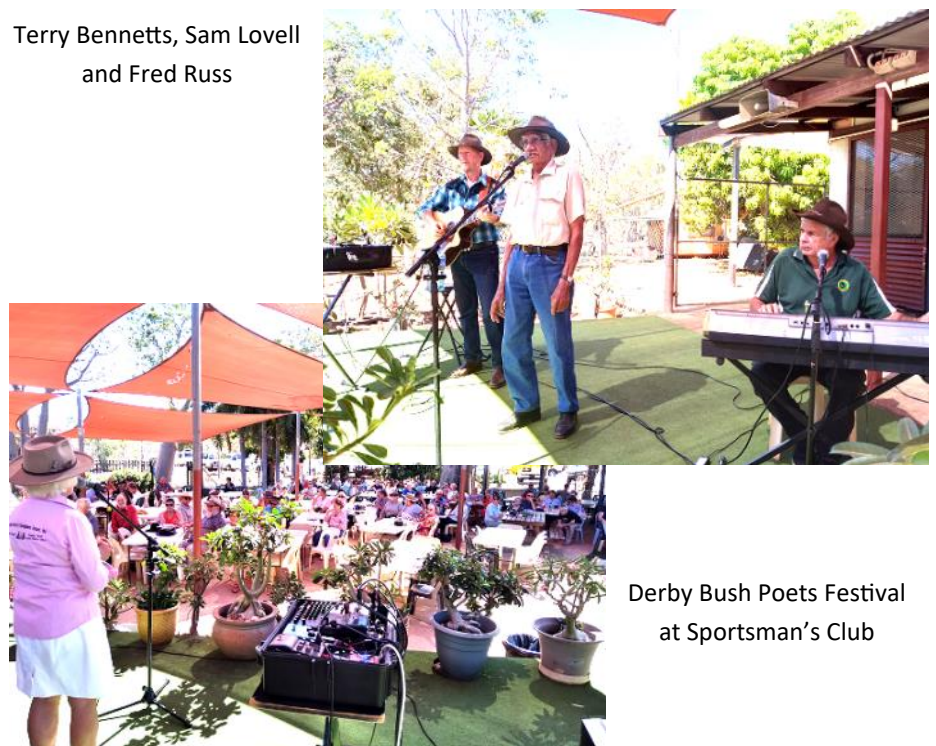
Derby Bush Poets Festival at Sportsman's Club