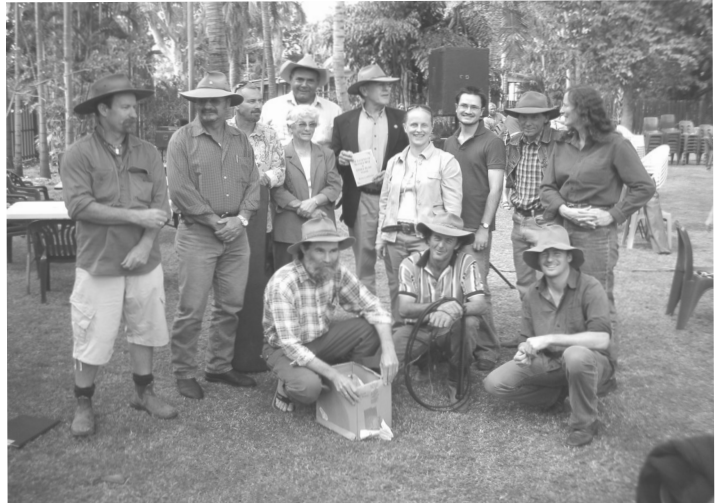
Derby Poets Brekky—All the crew

Fees for 2006-07 are now ( over ) due, they remain the same as last year, $15 single, $20 for a couple