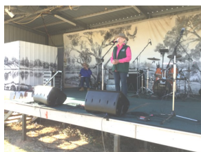
A great backdrop Camooweal