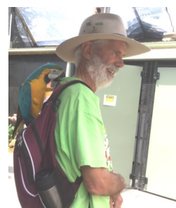
A very friendly Macaw in Cairns

I did eventually open my eyes! Chairlift in Cairns